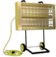
Portable Cart Unit CH 6424-1C with FHK-1 Cart

MODEL CH 2212-1C has two 1000 Watt elements that can be switched on / off by toggle switches to produce 1000 Watts or 2000 Watts of heat. - 15' cord and NEMA 5-20 molded plug.