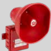
Models ASHH (15W) and ASUH (30W)

Hazardous Location Remotely Selectable Electronic Siren