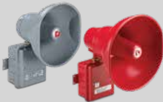
Models AM300GCX (15W) and AM302GCX (30W)

SelectTone® Hazardous Location Supervised Amplified Speakers