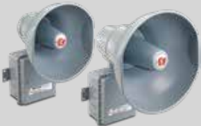
Models 304GCX and 304GCX-CN (15W), 314GCX and 314GCX-CN (15W)

SelectTone® Hazardous Location Amplified Speakers