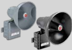
Models 300GCX and 300GCX-CN (15W), 302GCX and 302GCX-CN (30W)

Vibratone® Hazardous Location Electronic Horn