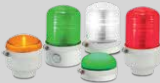
Models SLM100, SLM200, SLM300/350, SLM1400/1450 and SLMBS, SLMBD and SLMBP

Radiant Configurable Stack Light with up to 7 Modules and 5 Mounting Options