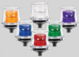
Models 225XST and 225XST-I

Electrarray® Hazardous Location LED Flashing Light