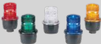
Models LP3M, LP3P and LP3S

Fireball® Supervised Hearing Impaired Strobe Lights