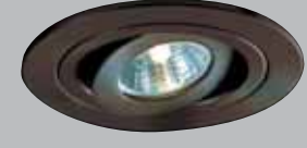
1495TBZ Tuscan Bronze Gimbal with Tuscan Bronze Trim Ring