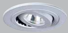
1495SL Silver Gimbal with Silver Trim