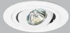
1495P White Gimbal with White Trim