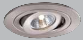
1495SN Satin Nickel Gimbal with Satin Nickel Trim