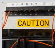
Facility & Safety ID ...and many more!