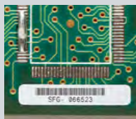
Circuit Board Identification