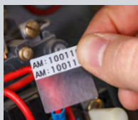
Wire & Cable Marking