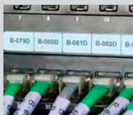
Patch Panel & Terminal Block ID