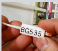
PermaSleeve® Wire Marking Sleeves