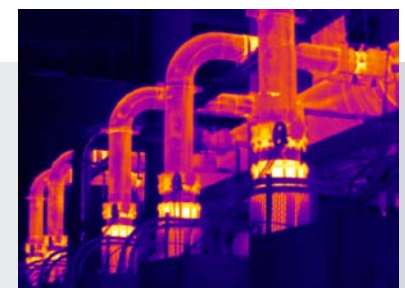
MultiSharp™ Focus, available on the Ti450.