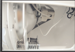
Lamp Suspension System