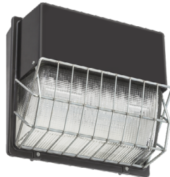
WG - Wire guard