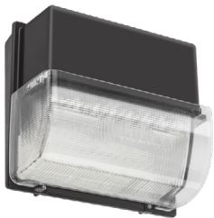
VG - Vandal guard