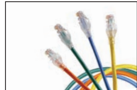
CAT6+ Bonded-Pair Patch Cord