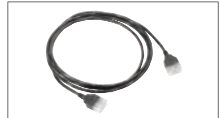
CAT6+ GigaBIX Patch Cord, BIX-BIX, 4 ft