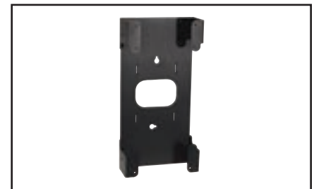
GigaBIX Cable Management Module