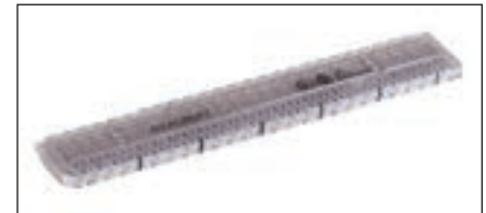
GigaBIX Connector, 6-port