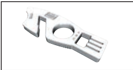
1797B Cable Preparation Tool

The Patch Cord Tool allows to connect and disconnect RJ45 patch cords installed in very high-density environments (48-port, 1U patch panels and high-density networking equipment).