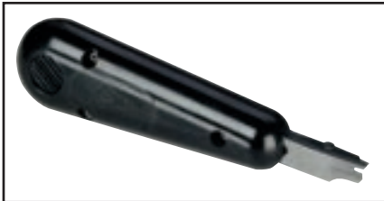
AX100749 IBDN 110 Connecting Tool

The IBDN 110 Connecting Tool is a no-impact connecting tool used to terminate cables, pigtails or cross-connect wires on any KeyConnect module or 110 product. The IBDN 110 Tool is a spring-activated hand tool. A single forward movement will seat the wire into the IDC clip and cut off the excess wire. The tool will terminate 22, 24 and 26-AWG plastic insulated solid copper conductors.