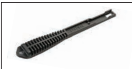
AX102775 Patch Cord Tool