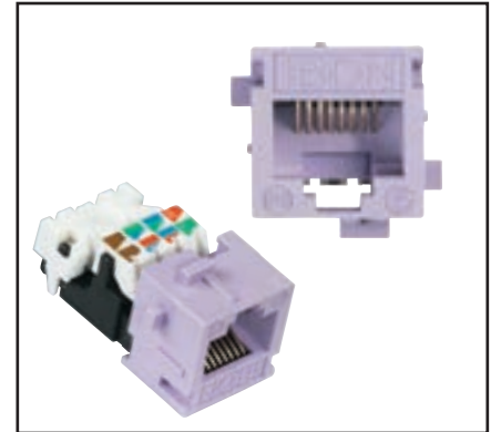
CAT5E EZ-MDVO Modular Jack, MDVO-Style