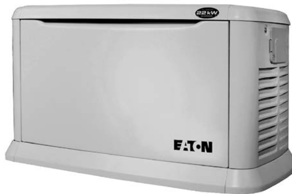
EGENX22A (includes EGENFASCIA)